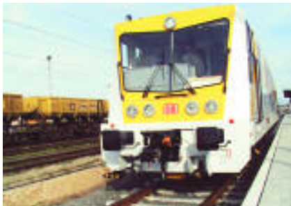
ETCS Test Vehicle

explained exactly the problems we had envisaged when considering testing object-oriented software; the Cantata++ solutions to these problems were truly remarkable." Following a successful evaluation of the tools and with the very promising experiences during the co-operation with IPL's technical support engineers, Patrick Roßbach was in a position to recommend that IPL's tools were the best choice for the project.