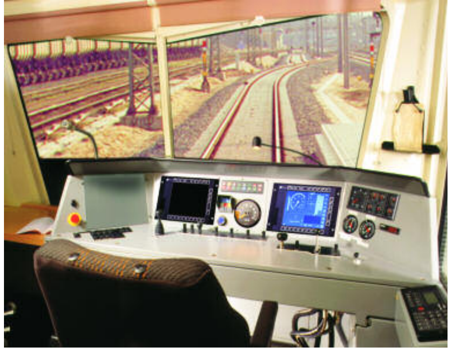
Alcatel's Test Track Facility

The main task was to develop two applications - one for radio block control on track-side written in C++, the other for the train itself to be written in C. The development environment was hosted on Solaris and the selected target architecture was an Alcatel-developed system known as TAS. For obvious reasons, the software had been assigned to the highest safety integrity level (SIL) defined by CENELEC. This SIL demands - among other quality assurance activities - the testing of the software at all levels, from module to system, including defect tracking. Alcatel was required to demonstrate